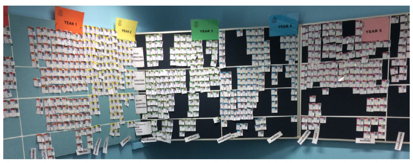
Figure 1. Reading Data Wall in a Queensland Primary School, used to monitor improvement in individual student learning, target individual support and to plan for teaching. Reprinted with permission from Department of Education and Training.

Gibbons writes: What has been heartening in this collaborative exploration has been the expansion of cross-school networks by having: